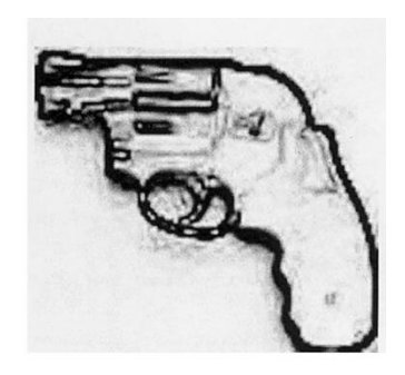
Frame 1 Frame 20 Frame 41

Eberhardt and colleagues found that participants primed with black faces were able to accurately identify the gun after fewer frames (in a more degraded state) than participants who saw white faces or no faces at all. Further, participants recognized crime-related objects more slowly after seeing white face primes than after seeing no primes at all. The authors interpreted these two findings to mean that thinking about black individuals made the category of crime more cognitively accessible, while thinking about white individuals made crime less cognitively accessible. To state the point slightly too strongly, black faces encouraged participants to attend to crime, whereas white faces encouraged them to ignore it.